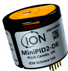
MiniPID 2 sensor